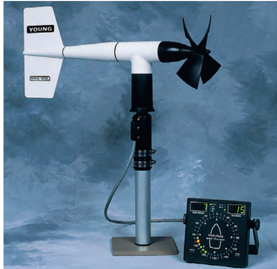
Wind Tracker pictured with Wind Monitor – MA

4-20 mA inputs, Serial NMEA, and Voltage outputs are standard on the Marine Wind Tracker. Alarms for both wind speed and wind direction are included.