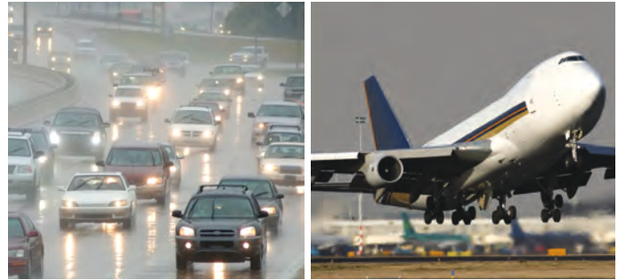
Suitable for a range of applications.

In aviation there is a trend towards increasing both safety and capacity at aerodromes which can require the installation of visibility and present sensors on runways and increasingly along taxi ways. The SWS-250 meets or exceeds all international aviation specifications for visibility measurement and present weather reporting whilst offering an affordable solution for both acquisition and cost of ownership.