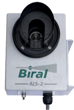
Biral's ALS-2 Ambient Light Sensor

The SWS sensor family is designed for easy installation by a single person and has an interface which simplifies system integration. The ASCII text data message is transmitted at user defined time periods or in response to a polled request. The standard data message provides MOR and EXCO along with present weather codes according to both WMO Table 4680 and METAR standards. An optional interface to the ALS-2 Ambient Light Sensor simplifies use in aviation applications where both METAR and RVR information is required. The ALS-2 Ambient Light Sensor data is appended to the standard sensor data message simplifying both installation and data processing.